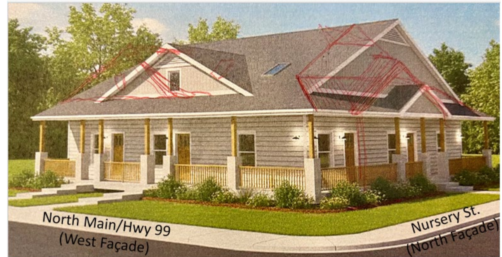
Rough Sketch 2.4.2026 HPAC Recommendations