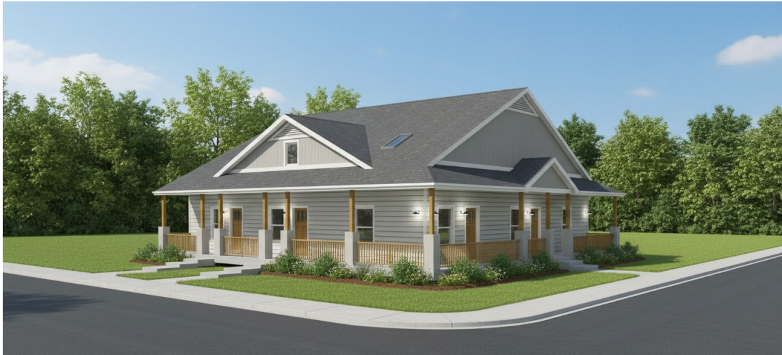
Revisions Received 1.28.2026